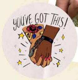
Abortion Storytelling Retreat 2023

Throughout the year, our engagement efforts have spanned both in-person and digital platforms, offering unique and indispensable spaces for individuals who have had abortions. Our in-person storyteller spaces have been a testament to the importance of carving out exclusive, safe havens for these individuals to share their experiences, find solidarity, and foster connections that transcend the barriers of stigma and isolation. Through our participation in conferences like Collective Power, Black Feminist Futures, and Abortion Care Network, we have extended our reach and broadened the dialogue around reproductive justice.