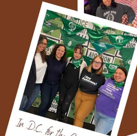
In D.C. for the Green Wave Gathering!