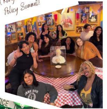
Take Rest '23