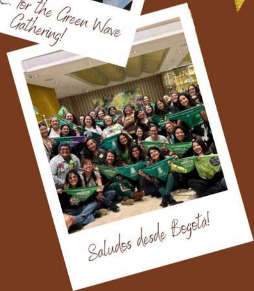
Saludos desde Bogotá!